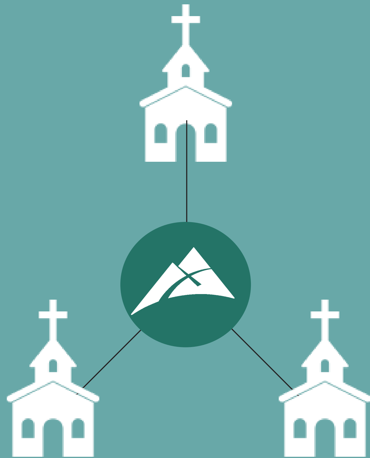
Crossroads Church with three locations functioning independently