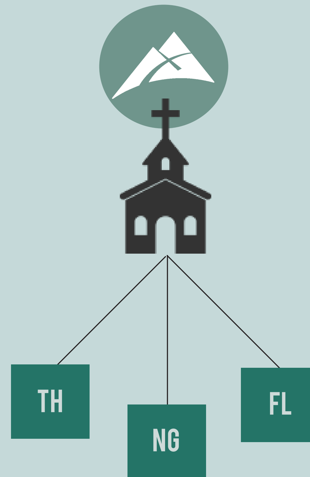
One Crossroads Church with three venues